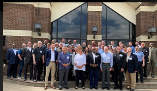
Participants in the Christian Forum event at Pentecostal Theological Seminary