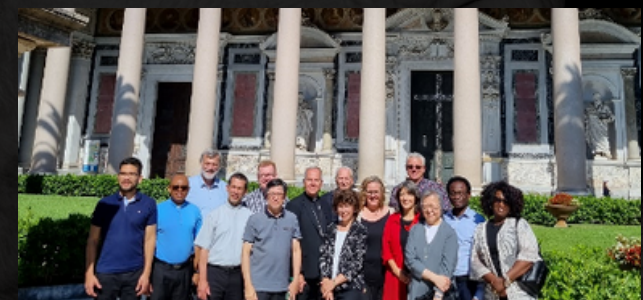
Participants in the International Catholic-Pentecostal Dialogue