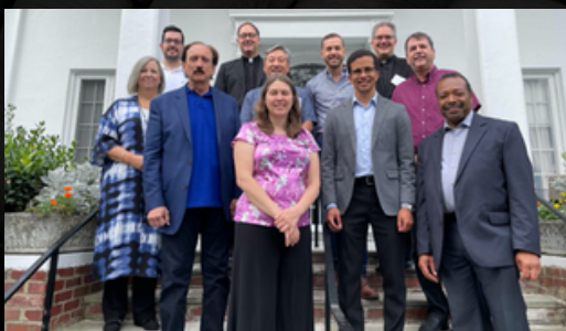
Members of the PCCNA/USCCB Conversation Teams